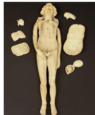
Figure 1: Manikins in first stages

The historical development of manikins in nursing education is a testament to the evolution of simulation-based training (Nehring and Lashley, 2009). Over the years, manikins have undergone significant advancements, transforming from basic models to sophisticated simulators (low fidelity to high fidelity) that closely resemble human anatomy and physiology (Nehring and Lashley, 2009).